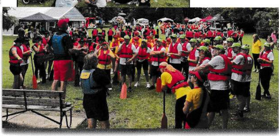
Briefing 3 boat crews at a time, for each heat. Each boat is timed and the boat with the best time over the three heats is the WINNER.

Such a happy, fun day in Canbury Gardens.